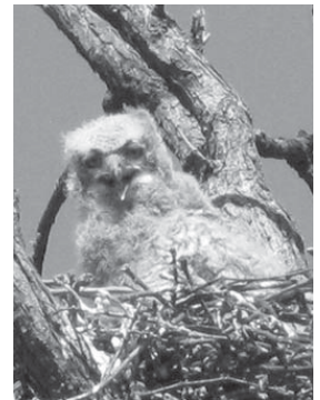
Owlets: passive and fierce expressions 3/14