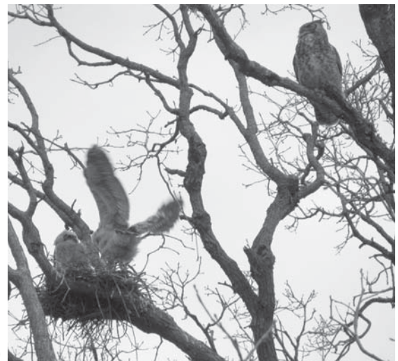
Three lower photos 3/26/09